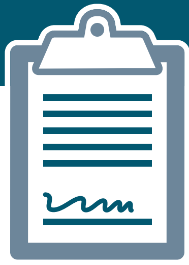
CHART ANALYSIS AND DEFICIENCY MANAGEMENT

$0.35 PER MINUTE of one coder's time. 2 MINUTES to retrieve a paper chart. 600,000 patient visits to code. $44,000 average medical coder salary.