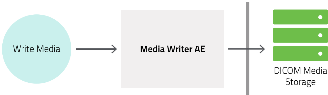
Figure 6. Media Writer Implementation Model

Media Writer provides the user the ability to write DICOM studies to various media types including CDs and DVDs.